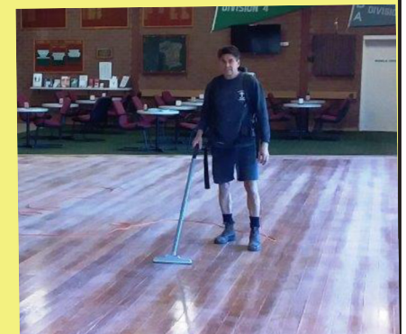
Working on the floor.