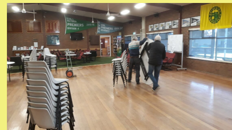
Clearing the hall in preparing for sanding.