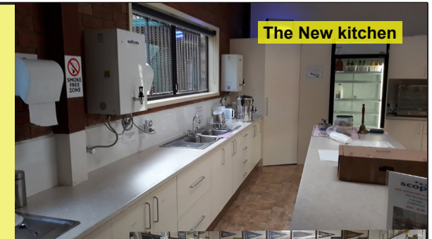
The New kitchen