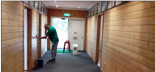
Work begins on refurbishing the foyer.